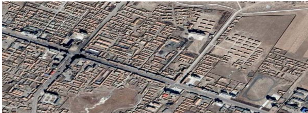
Chinese military installation near Lake Kokonor.