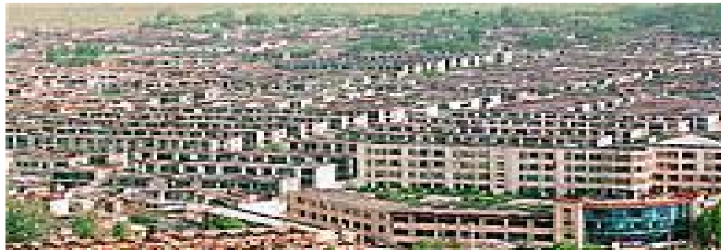
Chinese apartment and office buildings in central Lhasa reflect the demographic transformation in occupied Tibet.