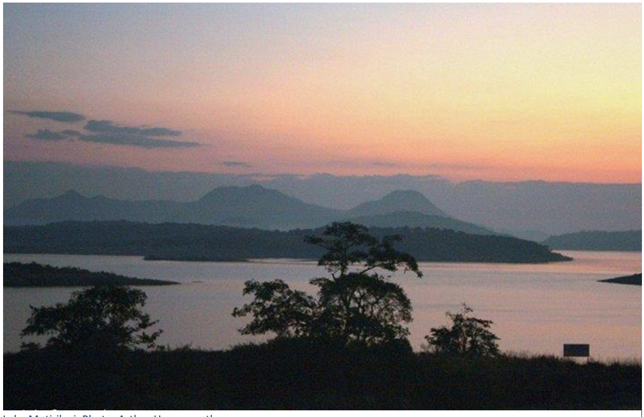
Lake Mutirikwi.