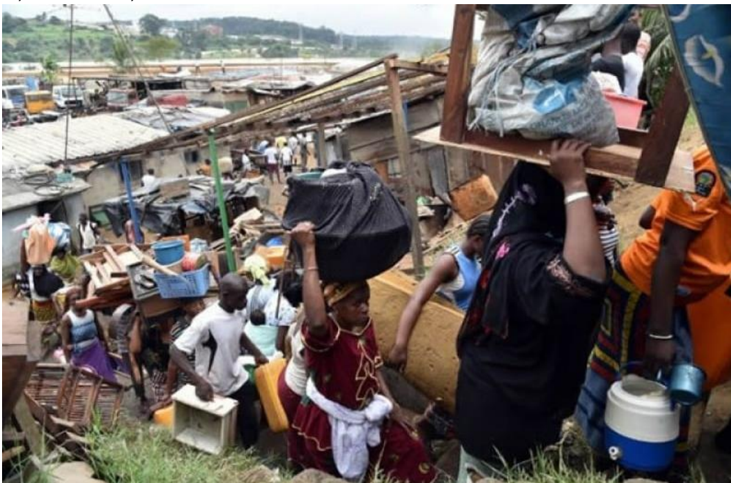
Figure 1 : Residents of the Berrengue Valley in the process of eviction with the few belongings they can carry.

For the moment, these victims have had no assurance of obtaining alternative accommodation, let alone alternative compensation. This is how since 5 January 2023, many families have been in distress and desolation. In the meantime, the authorities have remained evasive, if not silent, on the issue.