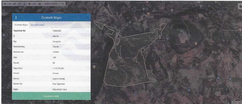
Figure 2- Details of the site

Limontluk Mahallesi, Vali Hüseyin Aksoy Cd. No:3, 33120 Yenişehir/MERSİN