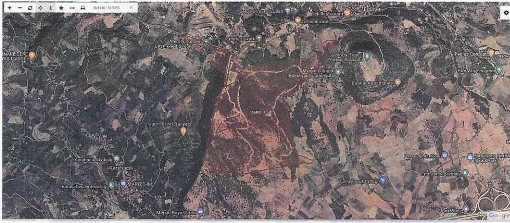
Figure 1- Satelite of the site

Please find below satellite images of the proposed site for your reference.